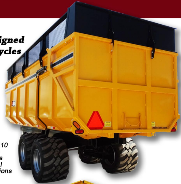
WL24 ST2010 Shown with 710/40 Tires and optional side extensions