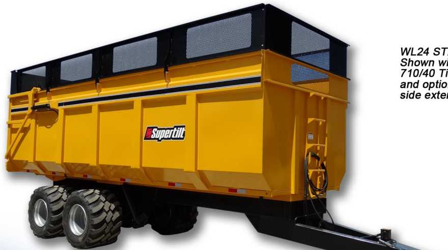
WL24 ST2010 Shown with 710/40 Tires and optional side extensions

That's why every Supertilt High Capacity Dump Trailer is designed with speed and efficiency the goal. From quick, stable dump cycles to high flotation tires, amazing 2200 cu.ft. capacity to high performance ADR hydraulic brakes, every Supertilt feature ensures faster field to farm cycles! Customers are realizing the full capacity of Supertilts, and utilizing the efficiency in countless ways! Grains & Forage is only the beginning.