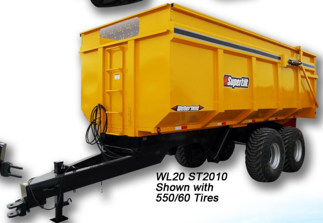
WL20 ST2010 Shown with 550/60 Tires